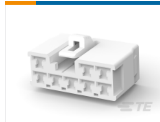
TE Part # 175979-1 FF 187 PLUG HSG 8P NYLON NAT